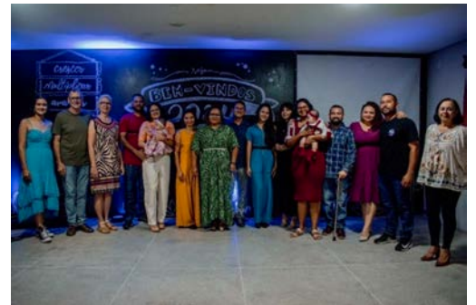
Missionaries and Volunteers on Staff