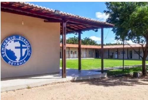
Bethany Evangelical Seminary Petrolina, Brazil